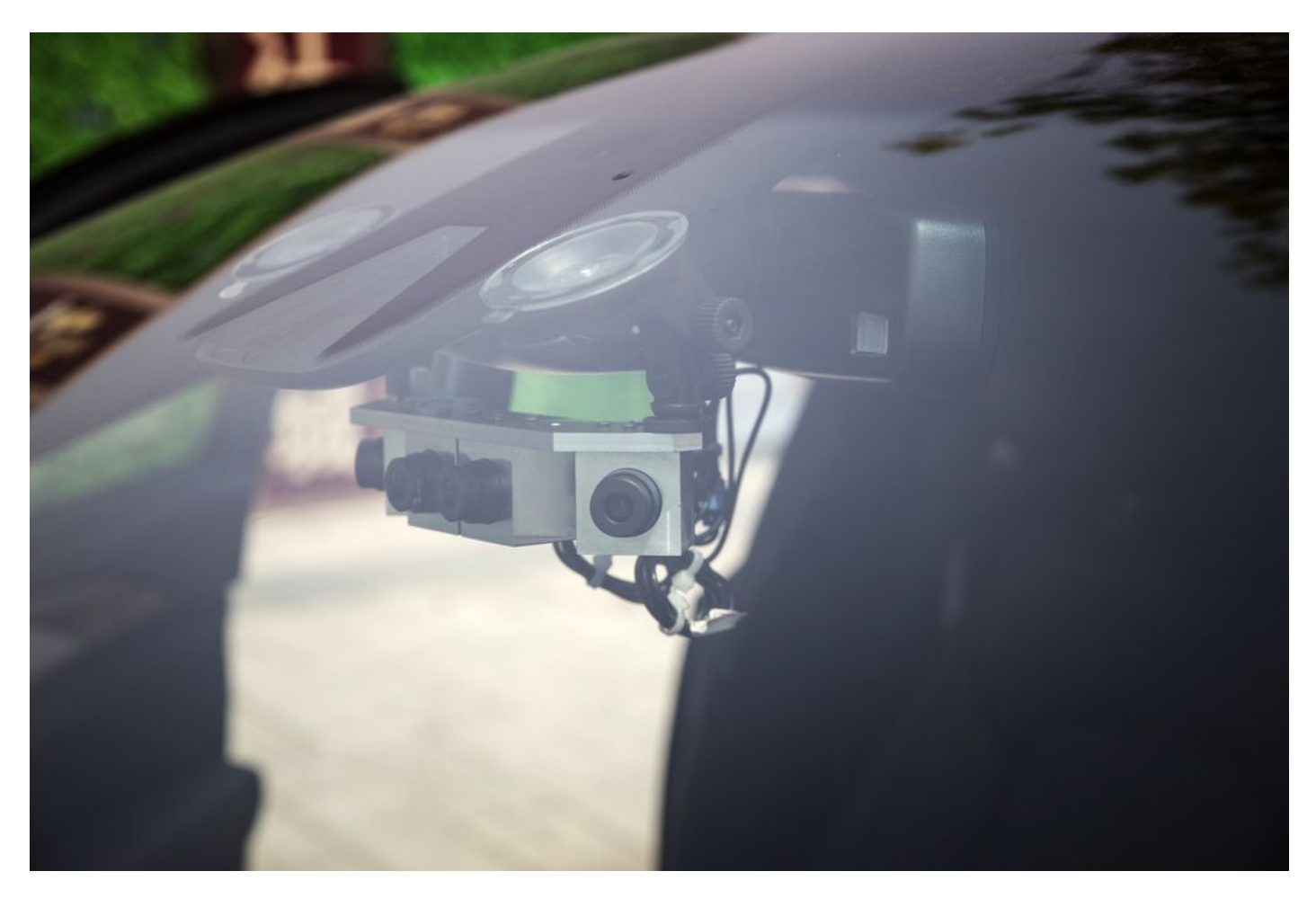
A SenseTime Group autonomous driving system.

All-Stars Investment Ltd. has raised another $500 million to expand its portfolio of startups beyond such Asian heavyweights as <u>Didi Chuxing</u>, expecting about 10 of the companies it's backed to go public within two years.